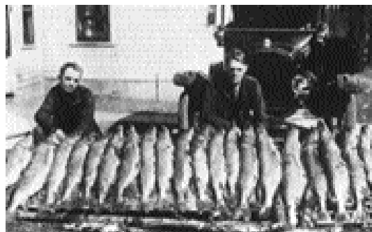
Anglers in the 1930s show off their catch of large pike.

Harvesting fish is still an important aspect of fishing in Minnesota and several sources of anecdotal evidence support this hypothesis. Length analysis of harvested and released fish indicated that anglers usually release only smaller, less acceptable fish of most species, and true catch-and-release fishing is not widely practiced by many Minnesota anglers (Cook and Younk 1998). Furthermore, anglers who harvested fish consistently rated fishing quality higher than two other groups of anglers: those who caught some fish but harvested no fish, and those who caught no fish at all (Persons 1993a, 1993b; Cook 2000). Conversations among Minnesota anglers illustrate how the creel limit is used as a benchmark for fishing success. Phrases such as "we caught the limit," "we filled out," or "we were one short of the limit" are common. Satisfaction with fishing is partially judged against the established creel limit, and creel limits may send an unintended message to anglers of what is biologically and personally achiev-