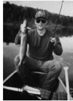
Today, some Minnesota anglers feel that the pike are declining in size

When creel limits are higher than the biological capabilities of the fishery and few anglers come close to harvesting a limit, this likely will contribute to low satisfaction with fishing. In Minnesota, current statewide creel limits exaggerate the biological capabilities of most fisheries. For example, the Minnesota adult (>15 inches) walleye population has been estimated at 14 million fish (MNDNR unpublished data) and approximately 2.3 million anglers fish Minnesota waters annually. If every angler harvested one limit of six walleye per year, the annual harvest would be 13.8 million walleye, or 98.6% of the estimated adult standing crop. Obviously, there are other factors that come into play here—not all anglers fish for walleye, some walleye harvested are